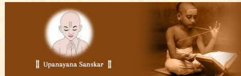
|| Upanayana Sanskar ||